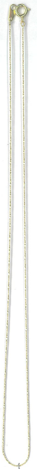
120SE D/C TW