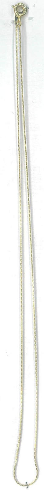
RD225 PVA D/C